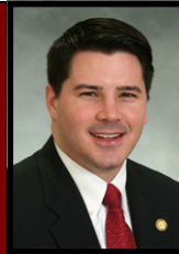
Sen. Andrew Brock Republican

1119 Legislative Building, Raleigh, NC 27601-2808 (919) 715-0690 • andrewb@ncleg.net